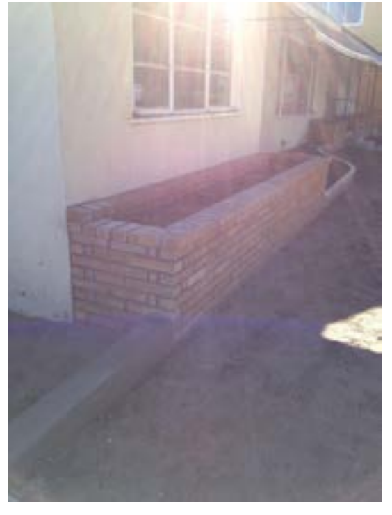
The planter in front of the house was repaired and concrete curb was added

The basketball back board is installed and ready for a half-court game, even at night with the great court lights.